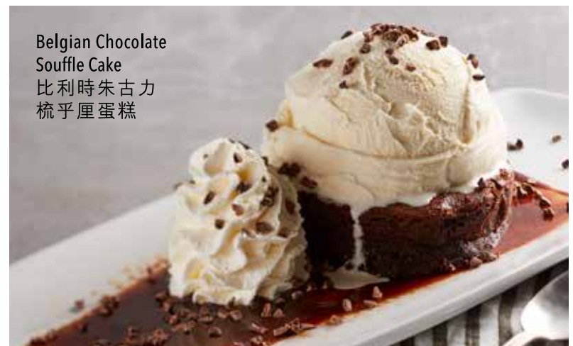
Belgian Chocolate Souffle Cake 比利時朱古力 梳乎厘蛋糕

All photos are for illustration purpose only. All prices are in Hong Kong dollars and subject to a 10% service charge. Items on this menu are for dine-in only. Take-out and Party menus are available.