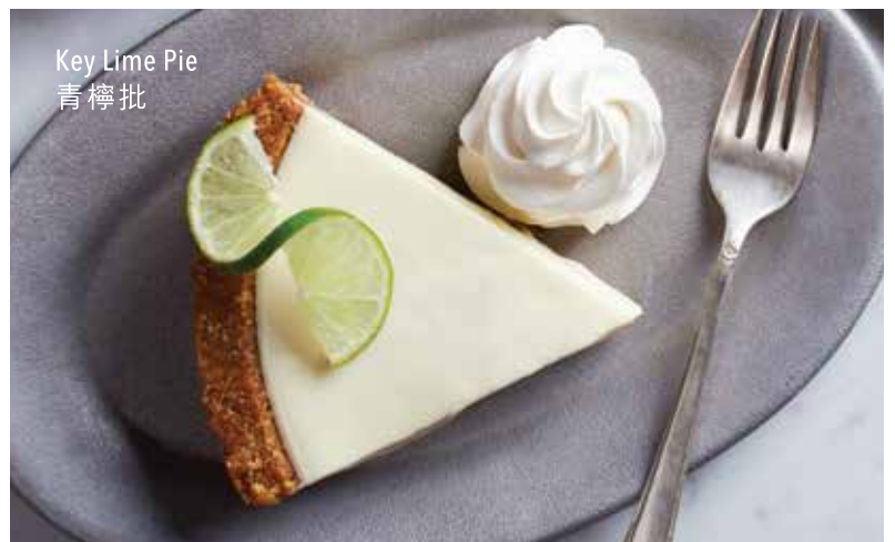
Key Lime Pie 青檸批