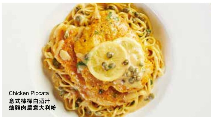
Chicken Piccata 意式檸檬白酒汁 燴雞肉扁意大利粉