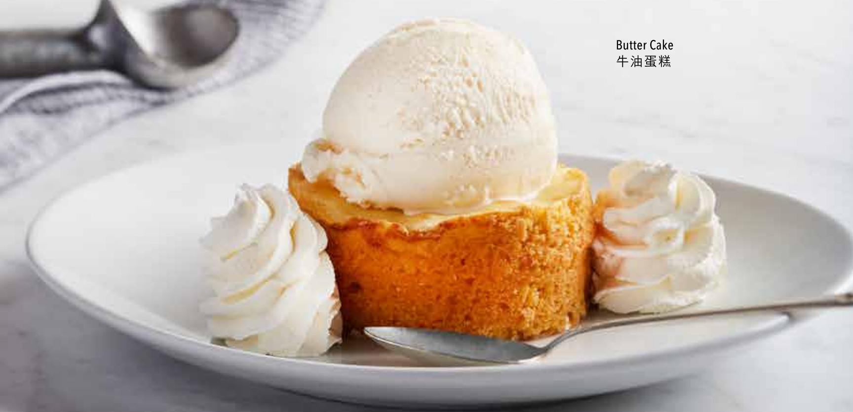
Butter Cake 牛油蛋糕